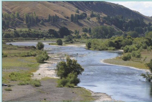
Typical Tukituki River Scene

many smaller rainbows in the long runs and larger trout under the willows. In the tidal zone both resident and sea run trout feed on whitebait and other baitfish. Trout feed voraciously on the whitebait that run up the river from September to November. This can be an exciting time for spin or fly fishing.