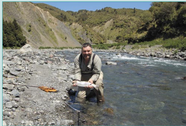
Upper Tukituki River

Upstream from the Tukipo River confluence the river is small and willow-lined. Sight fishing with light fly and spin fishing